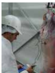
Figure 2. Measuring pH at the loin using a pH meter.

The rate of decline is commonly expressed in terms of the temperature at which the loin muscle of the carcase reaches a pH of 6. Temperature and pH readings are taken at timed intervals using a combined pH/temperature meter during chilling. Using the standard location for measurement is very important: this is found at the lumbar-sacral junction and overlaying fat is cut away to prevent fouling of the pH electrode.